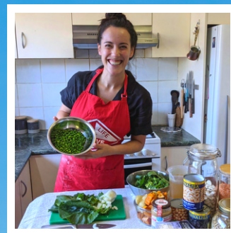
LIVE NUTRITION CLASSES

TIA CHI, PILATES, BOXING, CROSS TRAINING, YOGA, MEDITATION, SLEEP SESSIONS, MUSCLE BUILDING