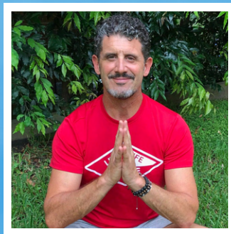
LIVE MEDITATION SESSIONS