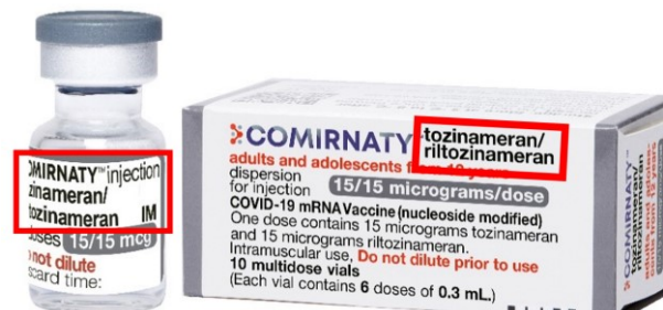
Example thawed use-by date label

Pfizer Bivalent (BA.4-5) 12 years+ (Grey) Batch: GE3042 Defrost Date: 01/12/2022 Use By Date: 09/02/2023 Store at 2°- 8°C & protected from light. DO NOT RE-FREEZE