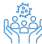
COVID-19 Community Support