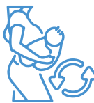
Antenatal Care - Routine