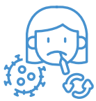
COVID-19 Ongoing Assessment and Management