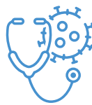
COVID-19 Initial Assessment and Management