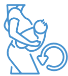
Antenatal - First Consult