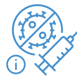
COVID-19 Vaccination Information