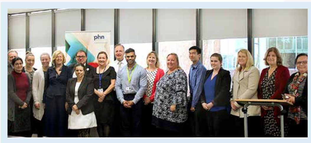
WentWest team 2016

In an effort to contextualise the economic costing analysis we captured baseline characteristics for each practice. The characteristics chosen were validated by practices as most relevant to the transition process. They included patient population, practice staffing levels, and grants received to aid the transition process. These data along with the costings estimates were recorded at the time of the interviews. The practice demographics and costings were entered into a spreadsheet format. KL undertook descriptive analysis of this data.