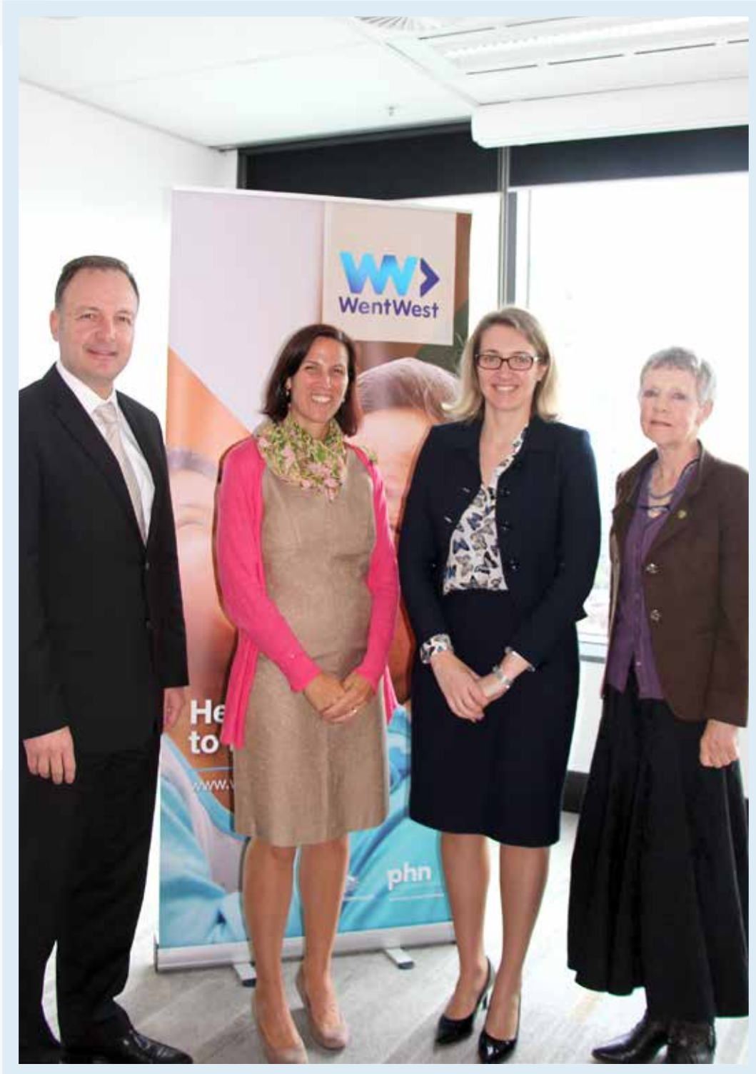
Attendees at PCMH launch in 2015