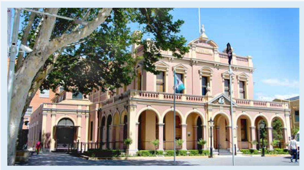
Parramatta Town Hall